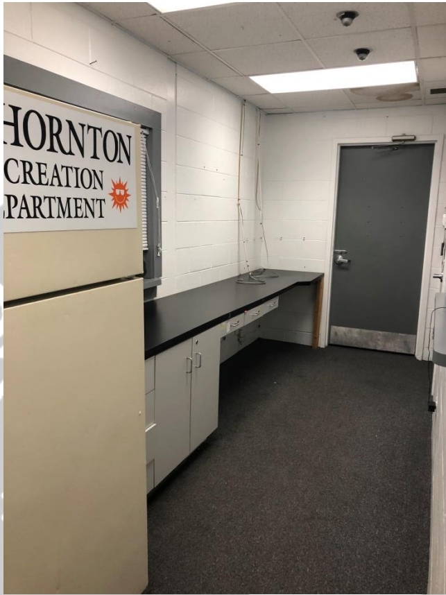
Old Small Office